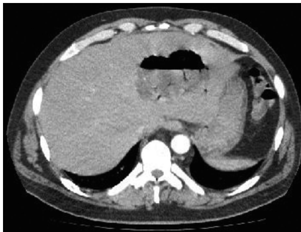
Figure 1. Hepatic abscess in the thorax CT

The patient was asymptomatic on the 30th day of the treatment. The drainage catheter was removed, oral sequential amoxicillin clavulanic acid was given, and the patient was discharged.