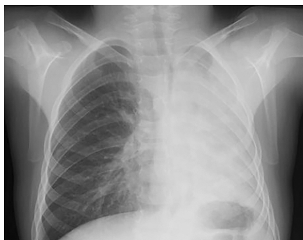
Figure 1. Chest graph of first patient

gression to respiratory distress, acidosis with total atelectasis of the left lung on chest radiography (Figure 1). Nasopharyngeal swab PCR of HBoV and RSV were both positive. He was monitored in Pediatric Intensive Care Unit (PICU). After prolonged treatment such as multiple antibiotic therapies, mechanic ventilation support, he was discharged.