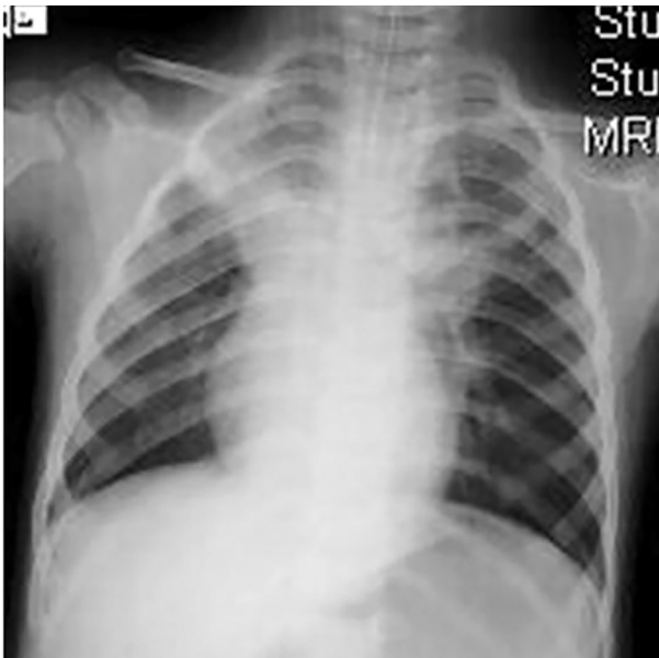
Figure 3. Chest graph of third patient