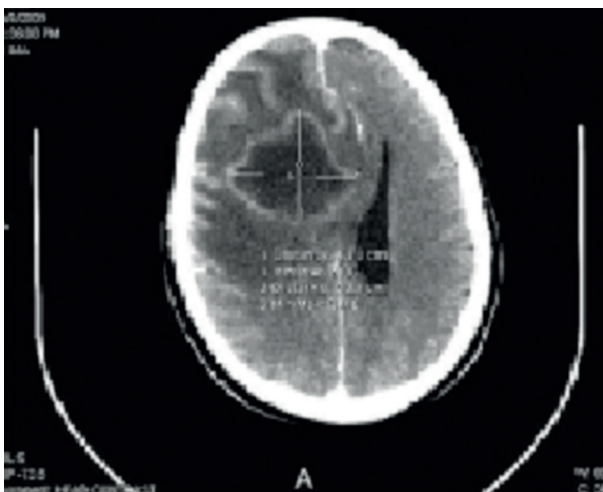
Figure 1. CT showing a large, irregular, peripheral ring-enhancing necrotic lesion in the right frontoparietal region causing significant mass effect and midline shift with perifocal oedema

For the management of the case, insulin infusion was given along with intravenous conventional amphotericin B (1.5 mg/kg/day). During the follow-up there was no improvement in the clinical status of the patient. Therefore third CT scan was obtained and which showed decrease in size of lesion. However there was enlargement in mass effect as well as increase in edema. Despite the application of antifungal therapy the patient eventually expired two weeks after the onset of the disease.